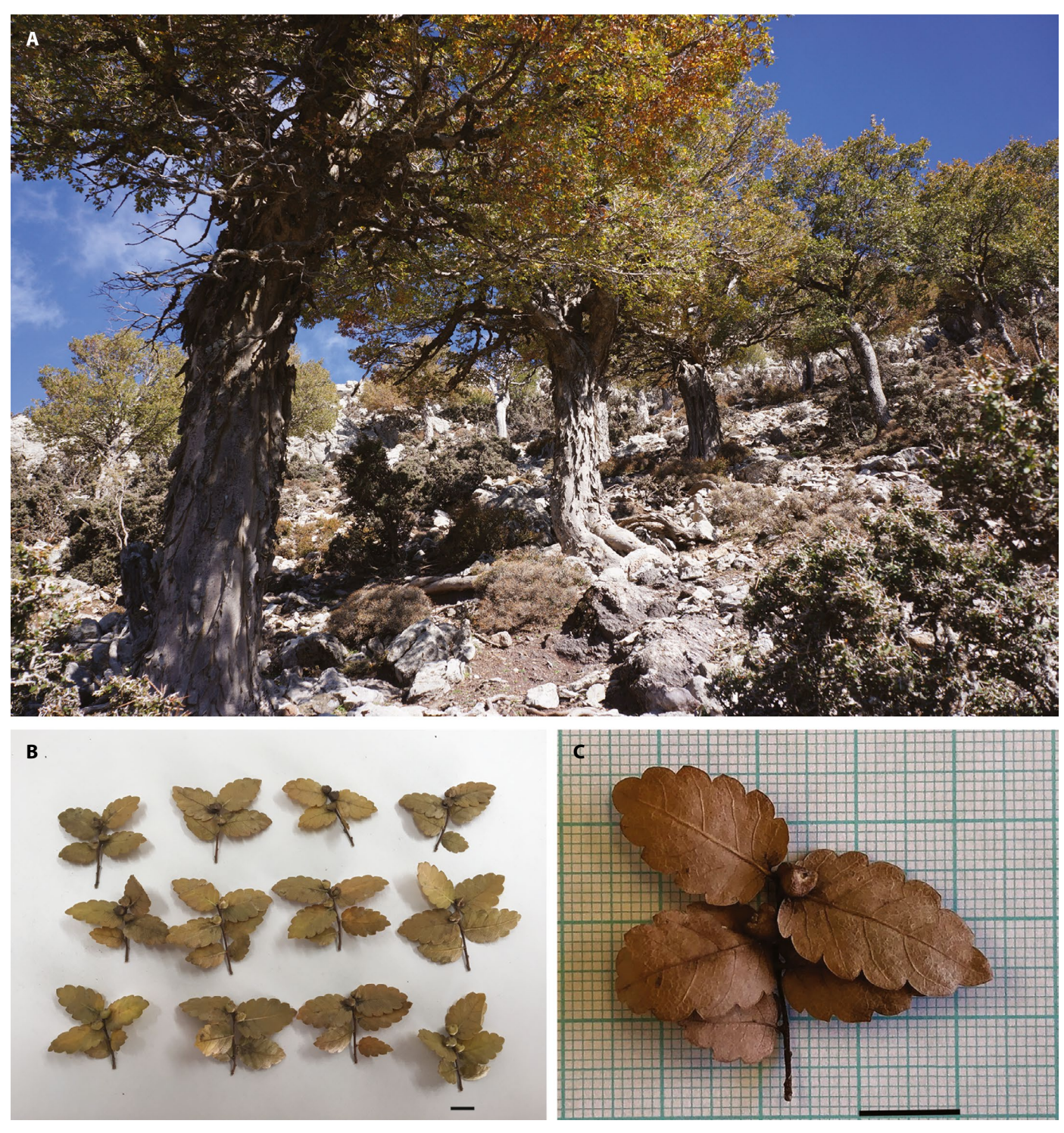
FIGURE 1. Dispersal units of Zelkova abelicea . (A) Population composed of large and fruiting trees (Dikti Mountains, Crete); (B–C) Closeup showing the morphology and variability of dispersal units used in this study. Scale bars = 10 mm.

Mountains (Søndergaard and Egli, 2006). It is currently found in scattered and isolated stands within the five main mountain ranges of Crete (Lefka Ori, Psiloritis, Kedros, Dikti, and Thripti) distributed from 900 m a.s.l. to the upper tree limit at approximately 1800 m a.s.l. (Egli, 1997; Kozlowski et al., 2014). In some areas, Z. abelicea may form mixed stands with Acer sempervirens, Quercus